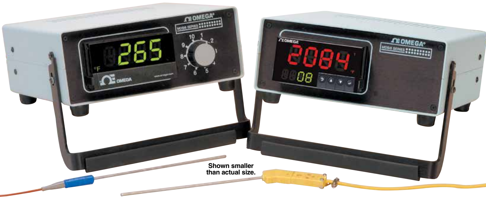
Shown smaller than actual size.

Single- and 10-Channel Models with Embedded Ethernet Connectivity Option