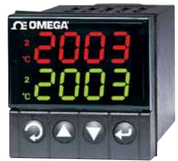
CNI16D, shown actual size.

CNi Series Models with Control and Alarm Outputs, Visit OMEGA