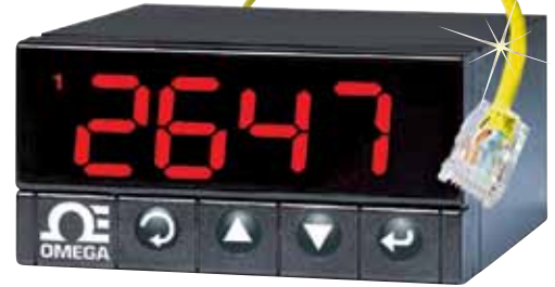
Shown smaller than actual size.

The CNi8 covers a broad selection of transducer and transmitter inputs with 2 input models.