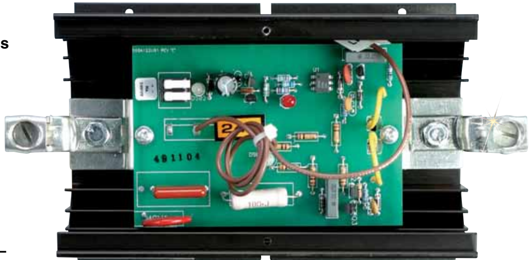
SCR19Z-24-060 shown without fuse shown much smaller than actual size.