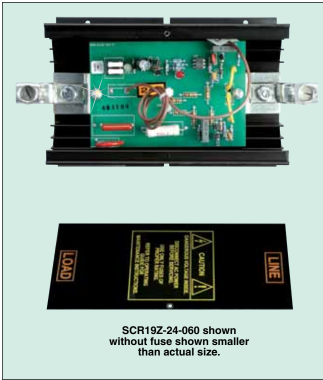
SCR19Z-24-060 shown without fuse shown smaller than actual size.