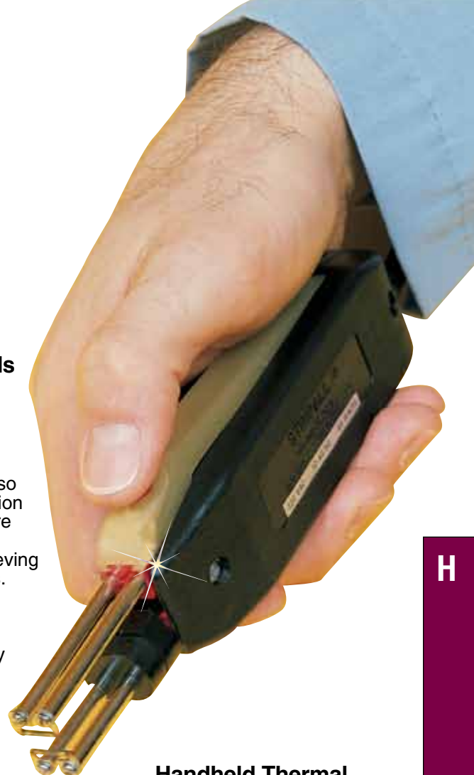
Handheld Thermal Wire Stripper