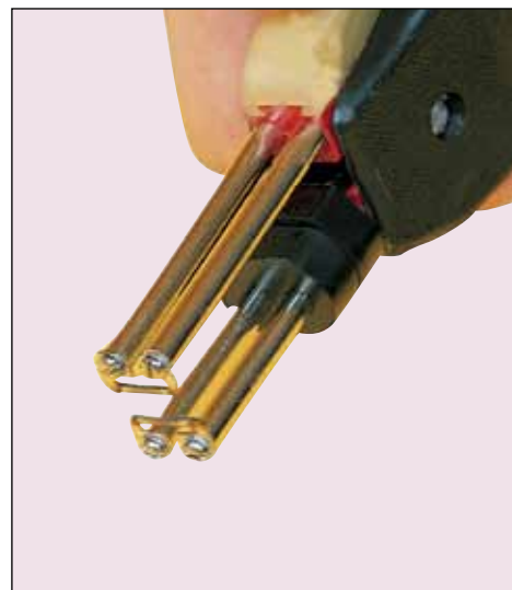
Blades are long-lasting, low cost and easily replaced.