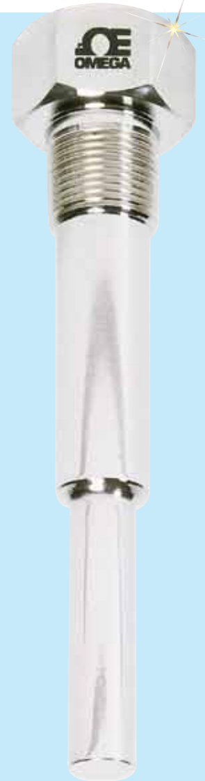
Shown close to actual size.

† NPSM internal pipe thread will accept both NPT and NPS male threads.