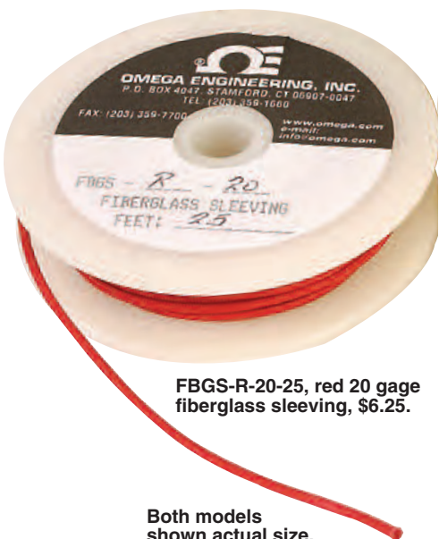
FBGS-R-20-25, red 20 gage fiberglass sleeving, $6.25.