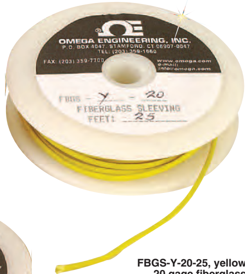
FBGS-Y-20-25, yellow 20 gage fiberglass sleeving, $6.25.

For More Sleeving Options, Visit omega.com/sleeving