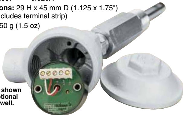
NB1TX shown with optional thermowell.