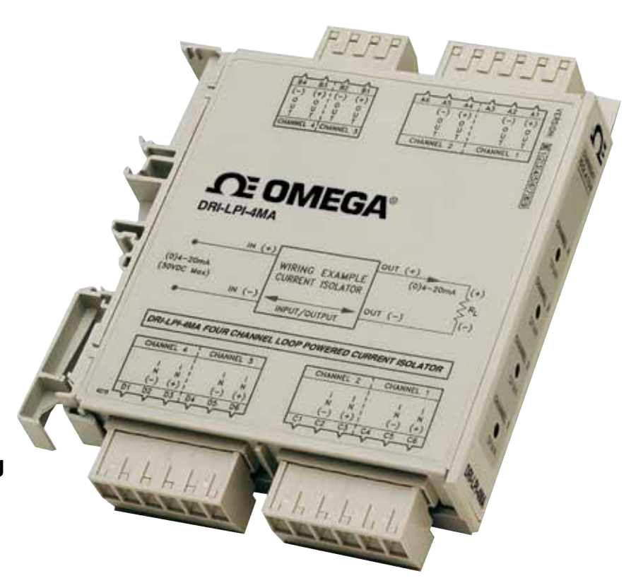
DPI-LPI-4MA shown smaller than actual size.

The DRI-LPI Series are DIN rail mount, loop-powered isolators with single (DRI-LPI-MA), dual (DRI-LPI-2MA) or quad (4) channel (DRI-LPI-4MA) capability. Each channel accepts a 0 to 20 mA or 4 to 20 mA input and outputs a proportional 0 to 20 mA or 4 to 20 mA signal. The DRI LPI Series provides 1800 Vdc signal isolation from input to output and channel to channel.