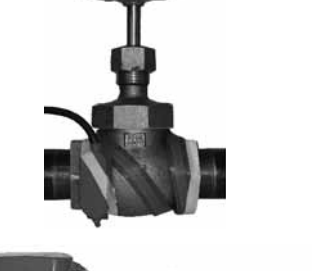
A.) Proper Installation (pipe and valve)

Plug power cord into appropriate grounded outlet.