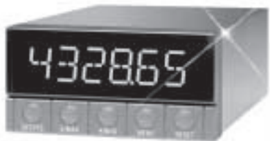
DP40-R24 Temperature, Process, Strain, Scale Universal and Rate Meters

This addendum would apply for Section 2.3 in your Serial Communications Operator's Manual.