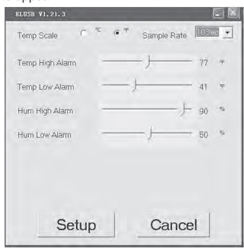
Fig. 3. The OM-143 configuration (Setup) window

Using your mouse, trackball or touchpad, first choose your Temp Scale and Sample Rate (sampling time). With regard to sampling time, using the shortest setting of 10 seconds may result in too much essentially identical data being stored in memory, potentially limiting its capacity to capture important events such as an unexpected excursion of temperature or