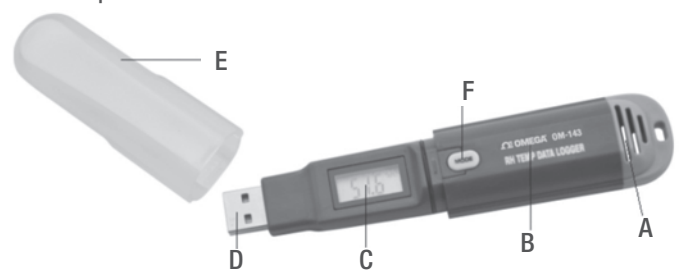
Fig. 1a. The components, controls and connector of the OM-143

Fig. 1a below shows the main components, controls and connectors of the OM-143. Fig. 1b (on the facing page) shows all possible indications on the OM-143's display. Familiarize yourself with their names and functions before moving on to the Setup Instructions.