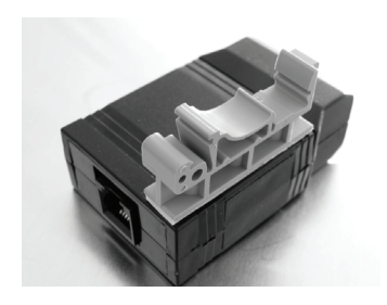
Communications Module Example

Peel the protective layer off of the adhesive tape on the bottom of one of the mounting clips. With the hinge end of the clip (see below) facing the end of the module with the communications connector, align the clip along the long (side) edge of the module and centered lengthwise within the flat surface of the module.