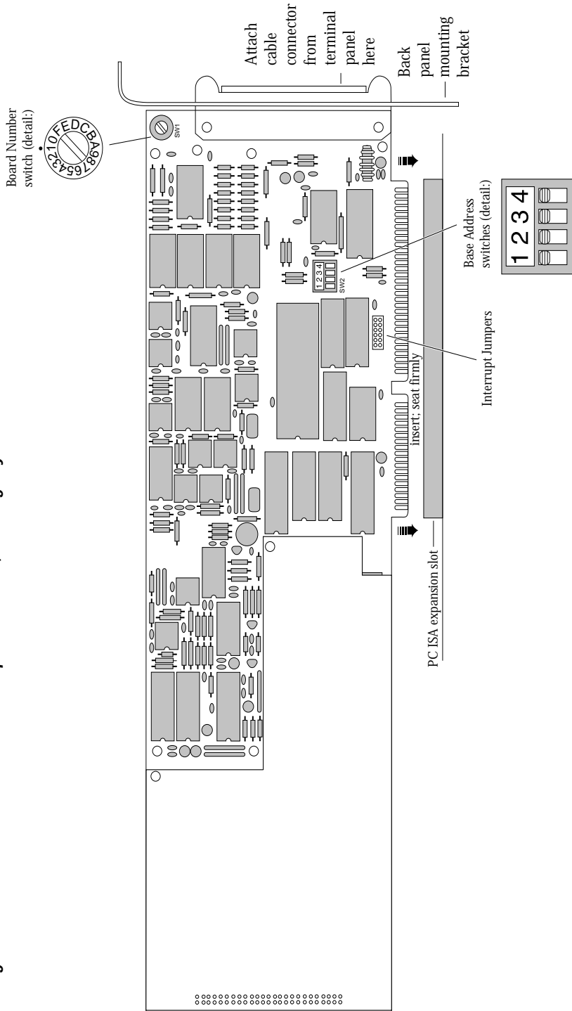
Figure 1. Illustration of WorkMate Data Acquisition Board, Showing Physical Installation –