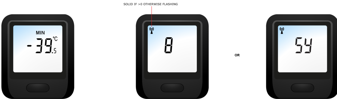
5) DATA SYNCING